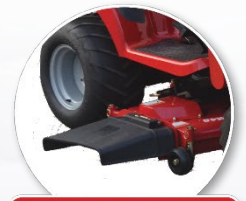
OPTIONAL MID MOWER