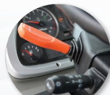
HI-LO POWER SHIFT